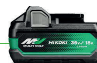
BSL36A18X HIGH OUTPUT BATTERY