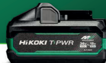
BSL3640MVT HIGH OUTPUT TABLESS BATTERY