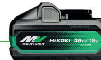
BSL36B18X HIGH OUTPUT BATTERY